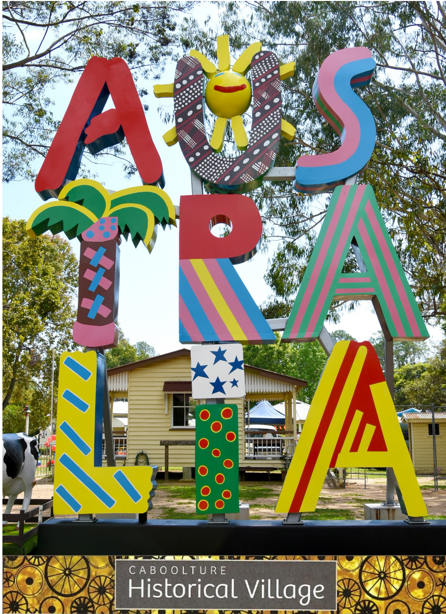
Kids Activity Booklet Version 4.1 August 2022